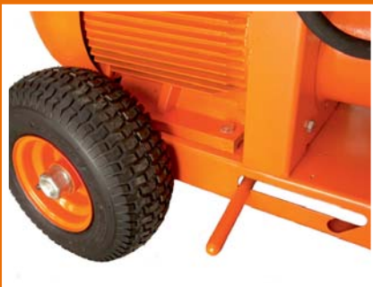
Galvanized frame with built in brake and pneumatic wheels.