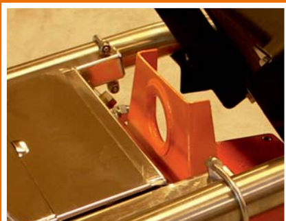
One centralized and balanced lifting eye.